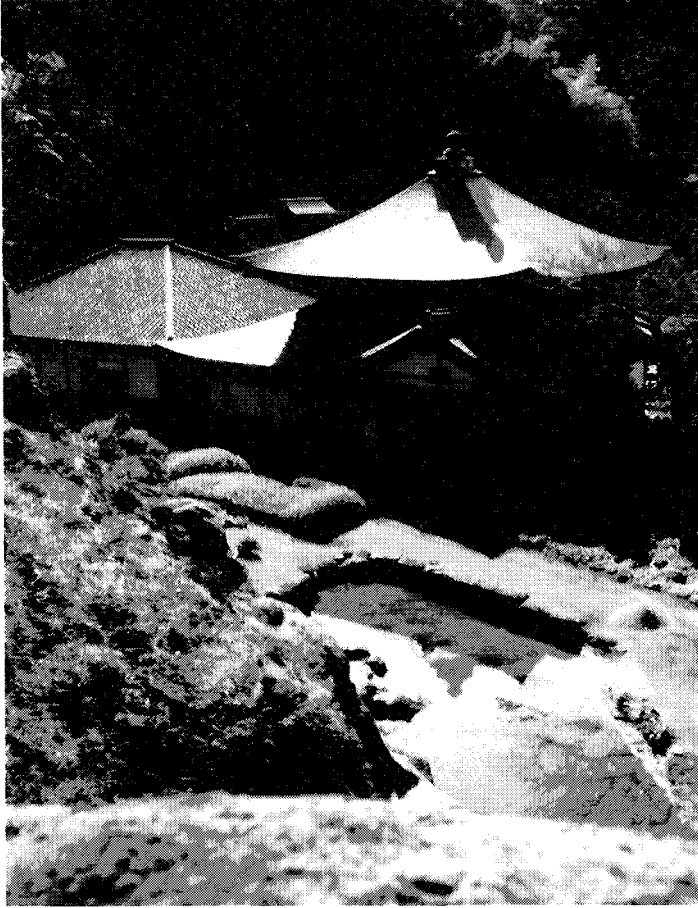
Fig. 2 The Dai Hojo is nestled into groves of trees at the piedmont of the mountain. The cone of sand to the upper right of the pond is a miniature depiction of Mount Fuji. View from the first turn of the ascent up the juhakkyoku passageway (Source: Author's photograph).

Le Dai-Hojo est caché dans des groupes d'arbres au pied de la montagne. Le cône de sable au coin supérieur droit de l'étang est une miniature du Mont Fuji. Vu du premier tournant de la montée, le passage juhakkyoku (Photographie prise par l'auteur).