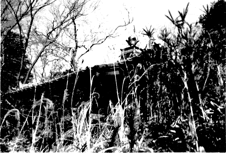
Fig. 4 The roofline of the present Ichiran-Tei, as seen from the final turn of the juhakkyoku passageway. The bronze final atop the tei is in the shape of a lotus leaf (Buddha) supporting a globe (enlightenment; satori, conventional Buddhist architectural symbols). The lotus is a metaphor for the transformation of the illusions of ordinary consciousness to reveal the reality of Buddha consciousness. The lotus is a water plant, and the roots of the lotus are often obscured by mud and silt. Metaphorically, one must make an effort to get beneath surface appearance to apprehend the roots of the lotus, just as one must make an effort to get beneath surface appearance to apprehend the "Original Face" of Buddha consciousness. Nichiren (1222-1282), a follower of the Lotus Sutra, poetically termed this prevalent Buddha image the "Lotus of Truth."