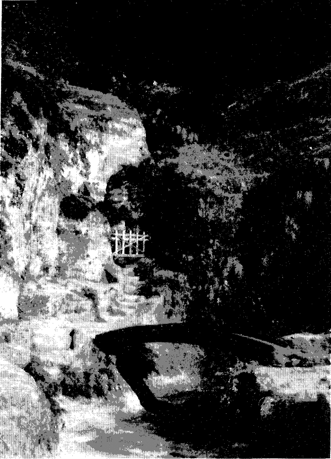
Fig. 3 View of the juhakkyoku passageway cut into a concave channel in the hillock of the piedmont of the Kamakura mountain range. The passageway at points is over six feet deep into the earth. The gate acknowledges that visitors are presently not permitted ascent to the Ichiran-Tei . In the foreground is one of two wooden bridges spanning channels of the pond crossed to reach the initial steps cut into the earth clearly seen beneath the wooden gate.

Vue du passage juhakkyoku formant un canal concave au travers du pied de la montagne de Kamakura. Par endroits ce passage a plus de six pieds de profondeur. La barrière indique que les visiteurs ne sont actuellement pas autorisés à gravir l' Ichiran Tei . On voit en avant-plan l'un des deux ponts de bois sur les bras de l'étang permettant d'atteindre les premières marches, juste au dessous de la barrière de bois.